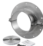
Kit de funda SLFO/Ext.

Para obtener información detallada, visite roxtec.com .